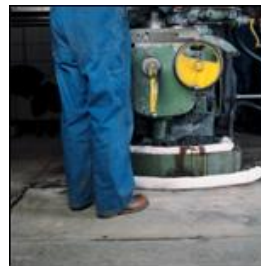
Socs Flexible sorbents in different lengths to surround machine areas and contain routine leaks & drips.