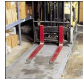
Industrial Rugs Durable for under fork lifts and other mobile equipment