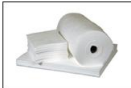
Oil-Only Ideal for outdoor leaks and spills of petroleum based fluids. Absorbs oil, repels water