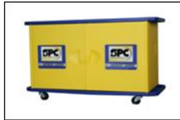
Sorbent Center Centrally located, holds back-up supply of pads & rolls.