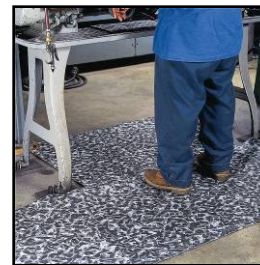
Rolls 2 and 3-ply extra tough material to keep work areas and aisles clean & dry