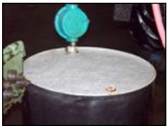
Specialty Spill pallets, drum covers, drain plugs, drip pans and pillows manage all types of leaks for specific applications