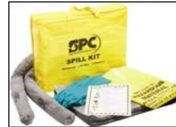
Spill Kits Emergency response for where spills frequently occur – i.e. receiving dept.