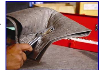
Pads Abrasion resistant pads to wipe equipment, tools as well as clean up of small water, chemical and oil based spills