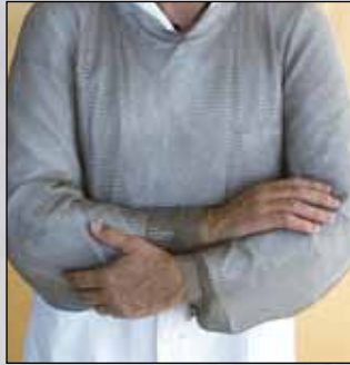
12SS – Short Vest