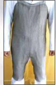
2540ASL – Split Leg Apron