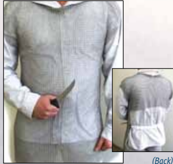
85B – Bolero Vest