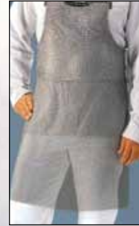
2234A – Apron