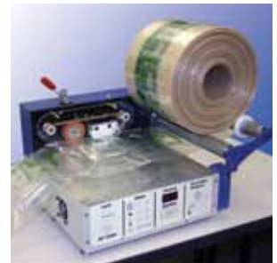
AP-2000 Inflatible Air Pillow System

For years, Intertape Polymer Group has been a trusted source for the products that secure your packages as a leading supplier of carton-sealing tapes and stretch film. It only makes sense that you would also rely on Intertape to protect the contents of your packages. That is why the iCushion™ brand Protective Packaging line emerged with the fastest Air Pillow System on the market and continues to expand.