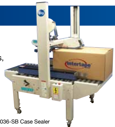
USA 3036-SB Case Sealer

Ask about Interpack's equipment capabilities and programs... including the Tape Head Program, Tape Incentive Program, Parts Voucher, Spare Parts Kit and more.