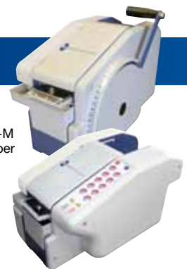
TWA 1000-M Manual Taper

This superior line of dispensers offers improved features and benefits enhancing the value created by an integrated system of closure material and dispenser. The increased capabilities highlighted in the TWA 1000-M Manual Taper and TWA 1000-E Electric Taper provide the quality your production requires.