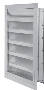
5NKJ3 (with optional flange)