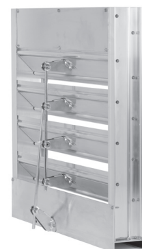
5NKH7 (rear view)