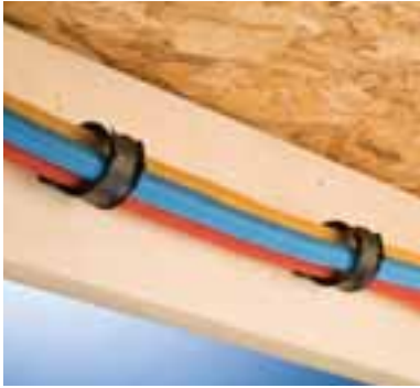
CADDY® CAT CR50 Supports cable, innerduct and flexible conduit