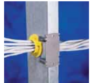
ESG1 Easy Snap Hole Grommet