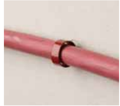
CADDY® LINIAN CLIP L11 for single cable support in concrete, block, wood and wall board