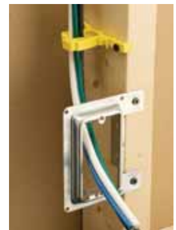
CG4 Cable Gripper Support MP1S Single Gang Mounting Bracket

Mille-Tie is a trademark of Millepede International Ltd. UL is a registered trademark of Underwriters Laboratories, Inc.