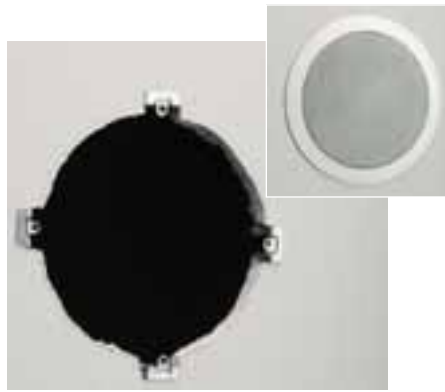
MPVTI Versatile Thread Impression