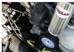
Fuel Injection Cleaner Connected to Inline Schrader Valve