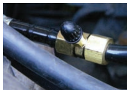
Nylon Fuel Line with Inline Schrader Valve