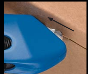
Continue your cut , letting friction of box maintain blade exposure. Blade guard will automatically relock at the end of the cut.