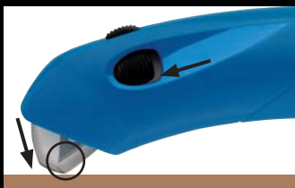
After the cut the blade guard relocks automatically, preventing slip off cuts, even while button is engaged.