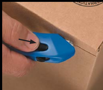
Push Release Button forward allowing guard to retract and expose the blade.