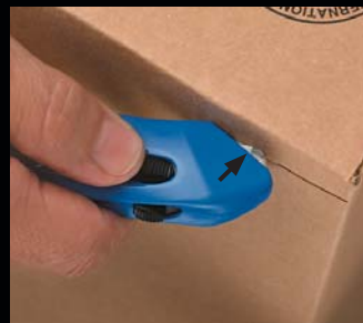
Press blade firmly into cutting surface to start the cut. Place opposite hand out of the path of a cut line.