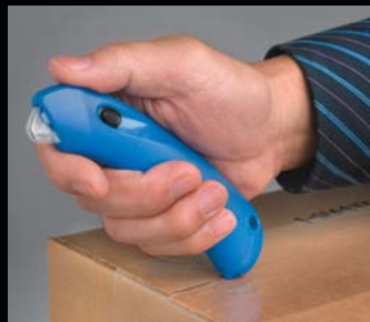
Blade-less Tape Splitting eliminates all cut injuries.

For Information Call: (800) 229-2233 Email: info@go-phc.com www.go-phc.com / rsc432