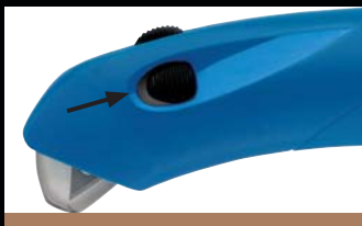
In Locked Position the blade is covered