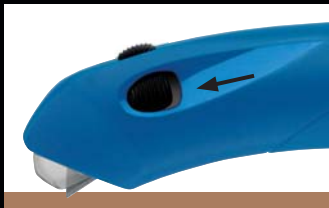
Push Release Button forward allowing guard to retract and expose the blade