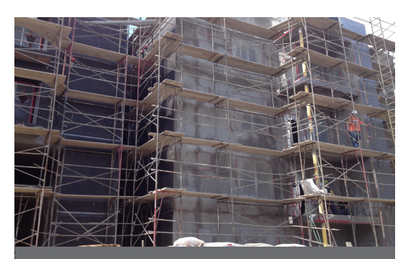
WNC relies upon heavy plastic and stucco tapes to protect surfaces as plaster is messy and can cause damage.

"When we start a job, we make sure to mask the windows, sheet metal and any other surface that needs protection," explained Coffman. "Plaster is such a messy trade. It can damage lots of things."