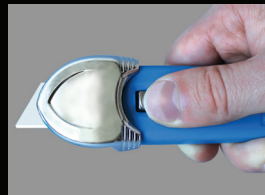
Tray Cut A Position For Maximum Blade Depth