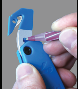
FILM CUTTER CHANGE Use ball point pen (above) to remove & replace film cutter unit.