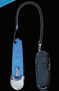
UKH-545 Safety Holster & CL-36 Coiled Lanyard Available