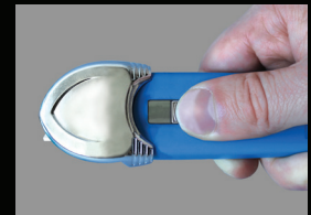
Tray Cut C Position For Minimum Blade Depth