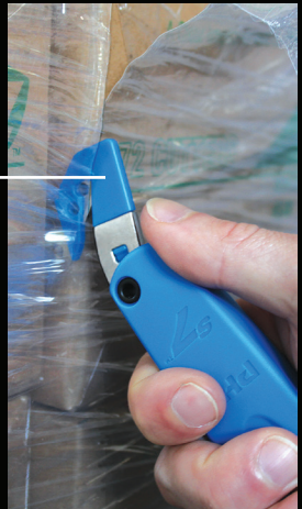
Easily Cuts Shrink Wrap