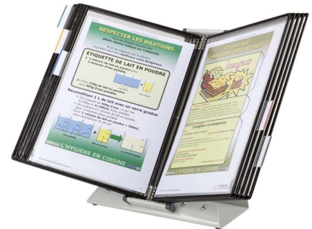
DA271 Antimicrobial Desk Unit Item # 1HEP3