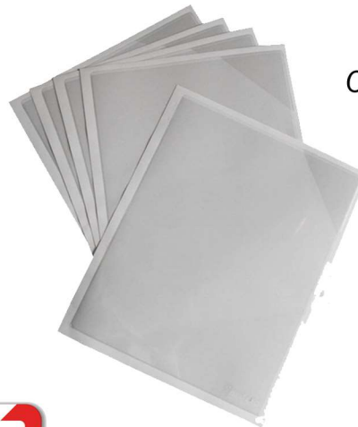
P194694 Magnetic Sign Holder Item # 36NH09