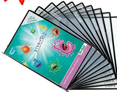
PA070 Antimicrobial Pockets Item # 1HEP5