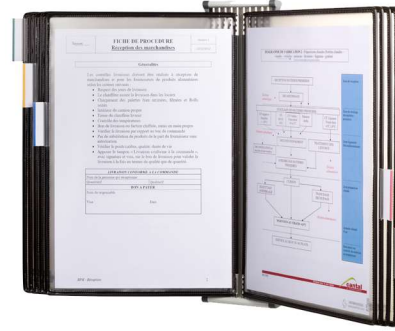
WA271 Antimicrobial Wall Unit Item # 1HEP2