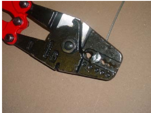
Completed crimp with lever tool.