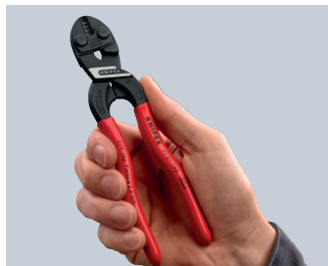
71 01 160: High cutting force with a length of just 6 1/4" – ideal for small hands