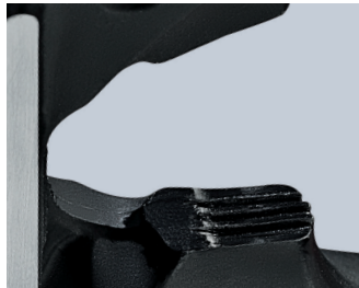
With gripping surface below the joint for gripping and pulling wires with a diameter from 3/64"