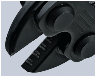
Micro-structured cutting edges allow easy cutting of large cross-sections

Pliers with tether attachment point for tool drop protection system